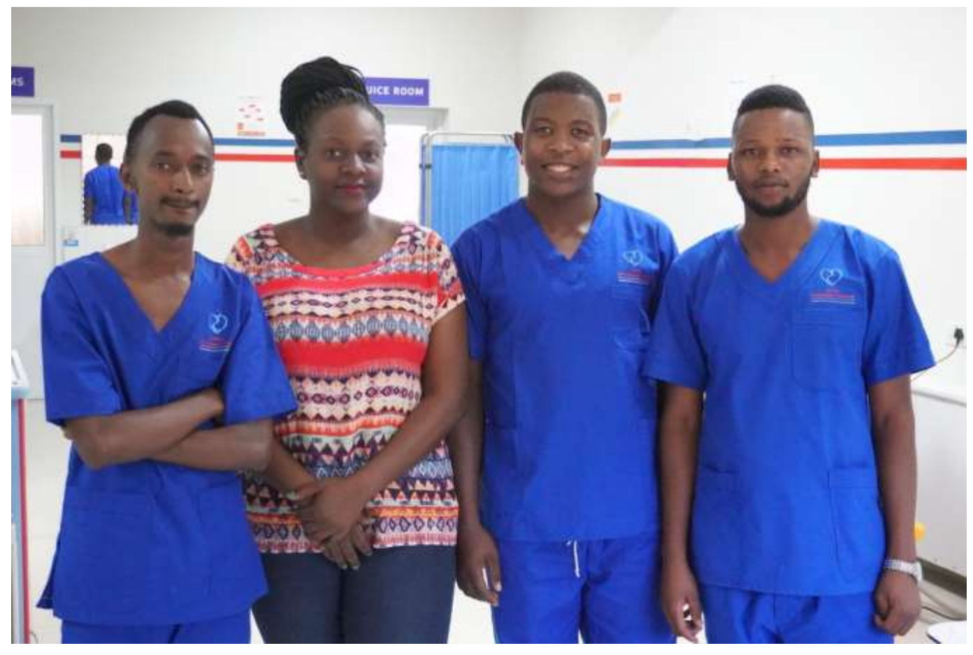
1Sengerema D.D. Hospital Dialysis department staff